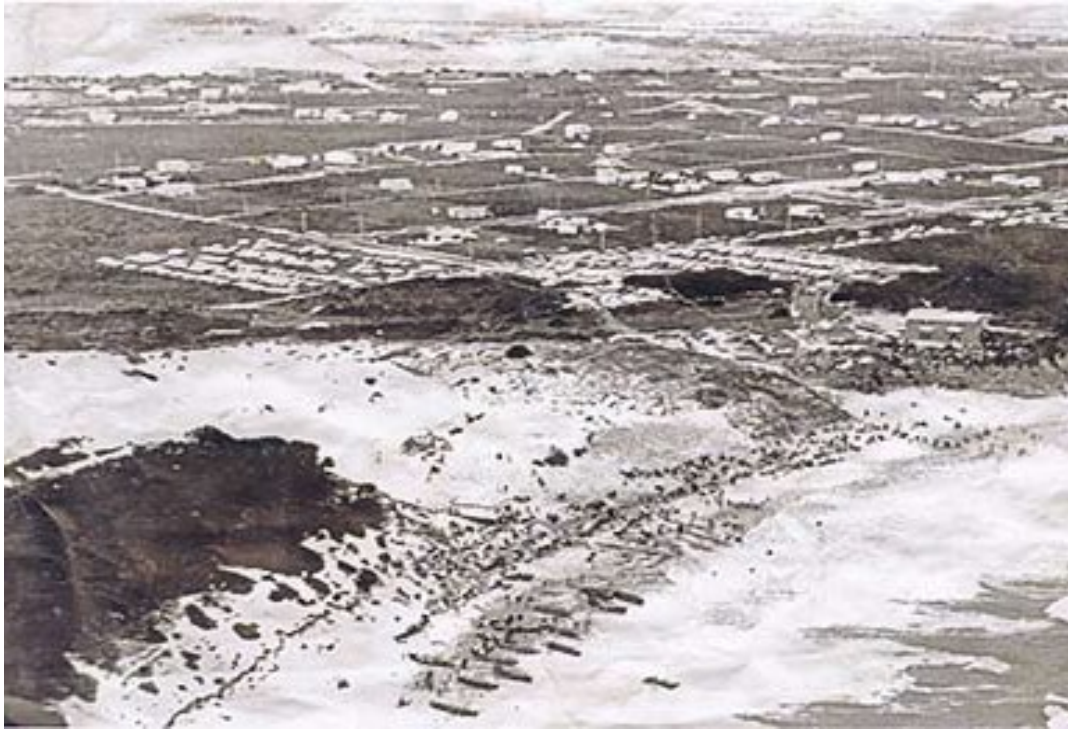
Aerial view of early Cape Paterson 1 st Surf. Note the beginnings of major change. Signs of revegetating the dunes with marram grass can be seen. The occasion was a Surf Life Saving Club Carnival with surf life boats on the beach. Note the Surf Life Saving Club's building centre right. A growing township in the background.