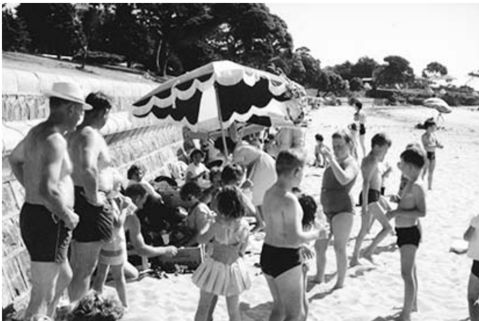
This Blue stone wall went from St. Kilda Street to beyond Pt. Hughes. Today the sand has buried most of the wall. Photo circa 1970s.