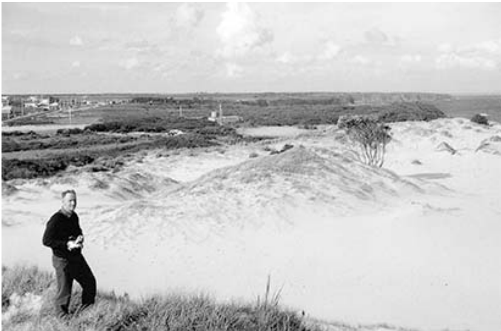
Looking over the 1 st Surf dune towards the embryonic township of Cape Paterson. First beach facilities constructed can be seen in the center background.