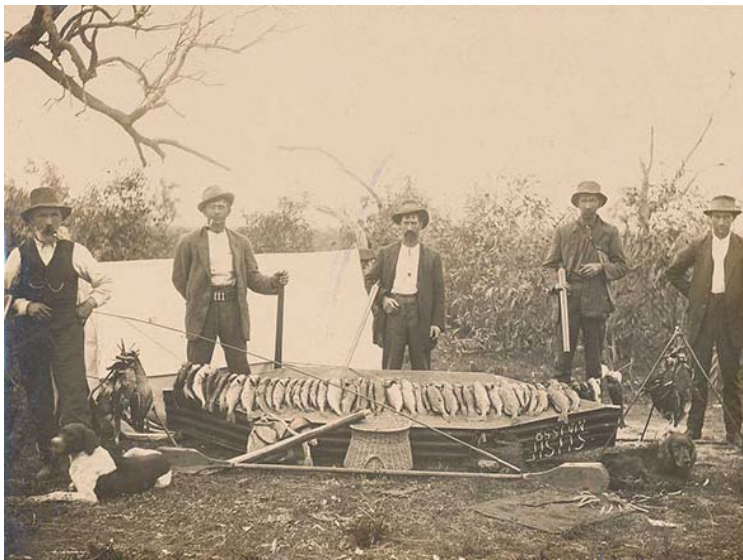
Early pastime - hunting and fishing. A very successful day! Note the unusual construction of the upturned boat.