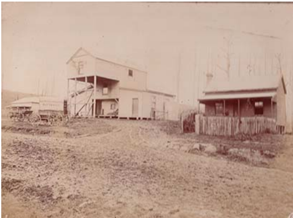
The first Kongwak Butter Factory. Typical house construction of the time.