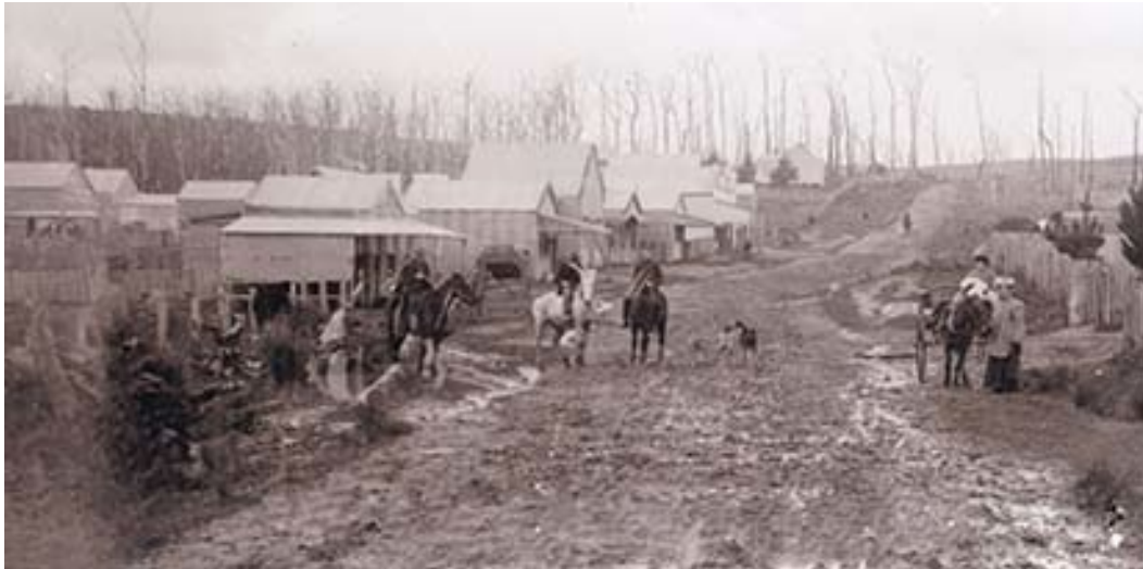
Another view of Archies Creek township looking in the other direction. Again the pub in the centre. And you think our roads are bad now! The football ground out of sight to the left.