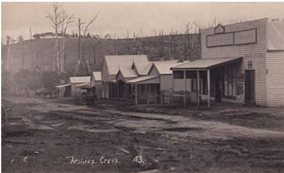
Very early photo of Archies Creek. Note the pub in the centre and the decimated vegetation in the background.