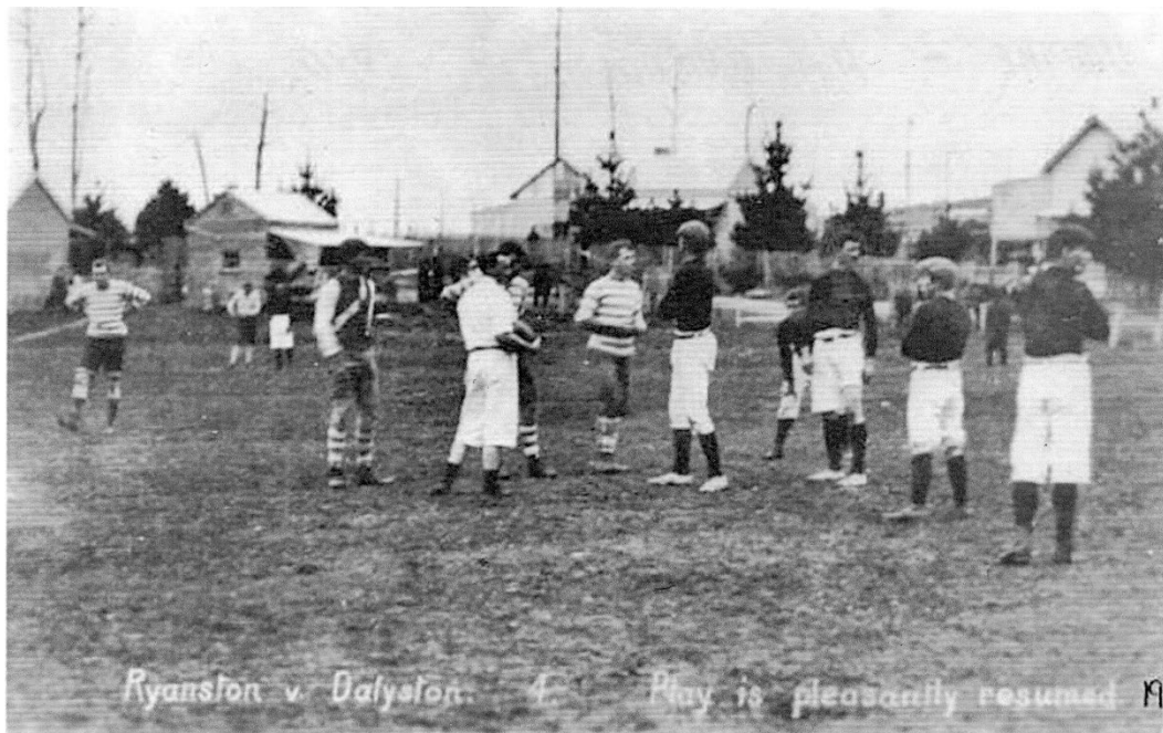
Archies Creek was originally known as Ryanston. This match took place on the Archies Creek oval in 1910. An interesting match – there was a major dispute and both teams played all day for one point in favour of Ryanston!