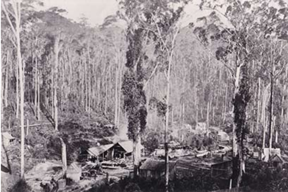
Original vegetation. The forest at Archies Creek before clearing the land for agriculture. This is Kennedy's Mill on Mill Rd. Archies Creek,