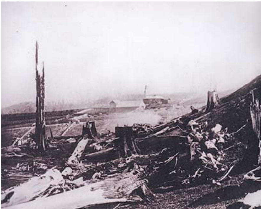
The devastating aftermath of fire at Glen Alvie.