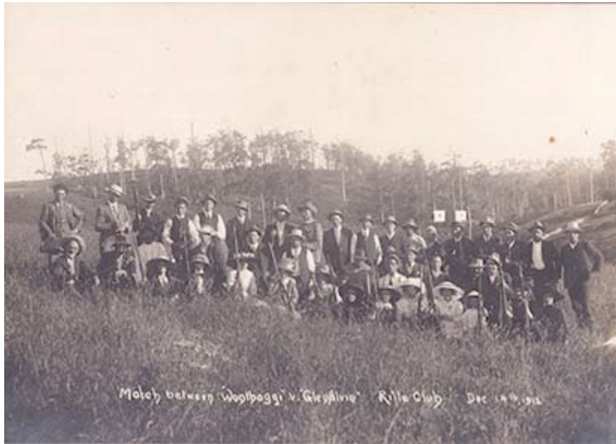
Rifle clubs were common in the local rural community. This photo was taken at Glen Alvie at a match between Wonthaggi and Glen Alvie on December 14 th 1912. Note the involvement of Women.