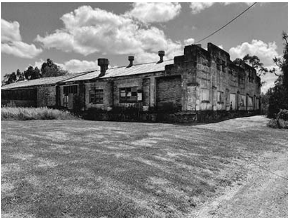
The unused Kongwak Butter Factory as it exists today.