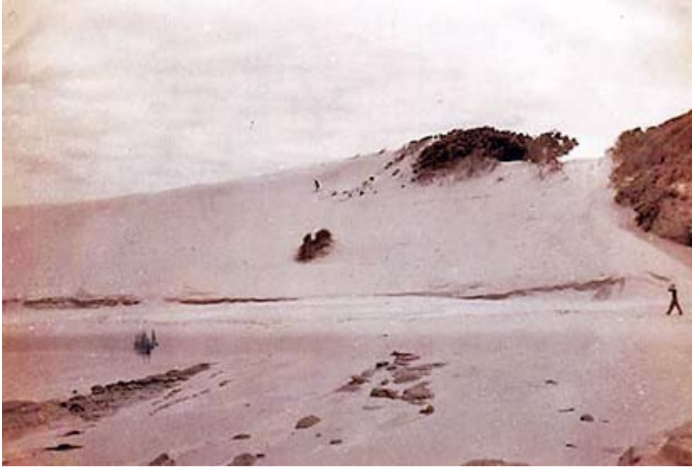
The original sand dune almost devoid of vegetation. This photograph was taken in the 1960s. The site of the Surf Life Saving Club building out of sight to the right.