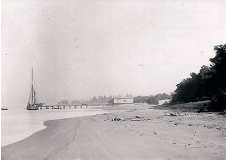
The original pier and Customs House at Inverloch. The location of the Customs House is now the car park by the current pier!