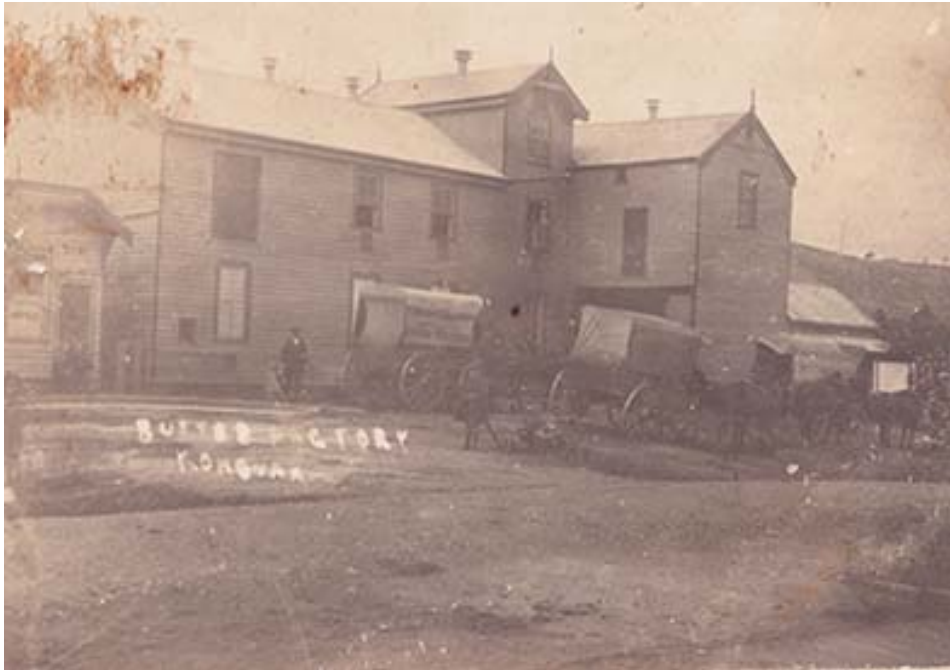
An enlarged and improved Butter factory at Kongwak. Typical horse and cart transport of cream cans in the foreground.